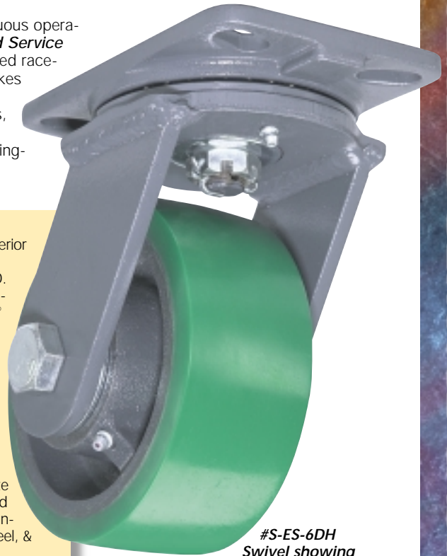
#S-ES-6DH Swivel showing Duralast® wheel