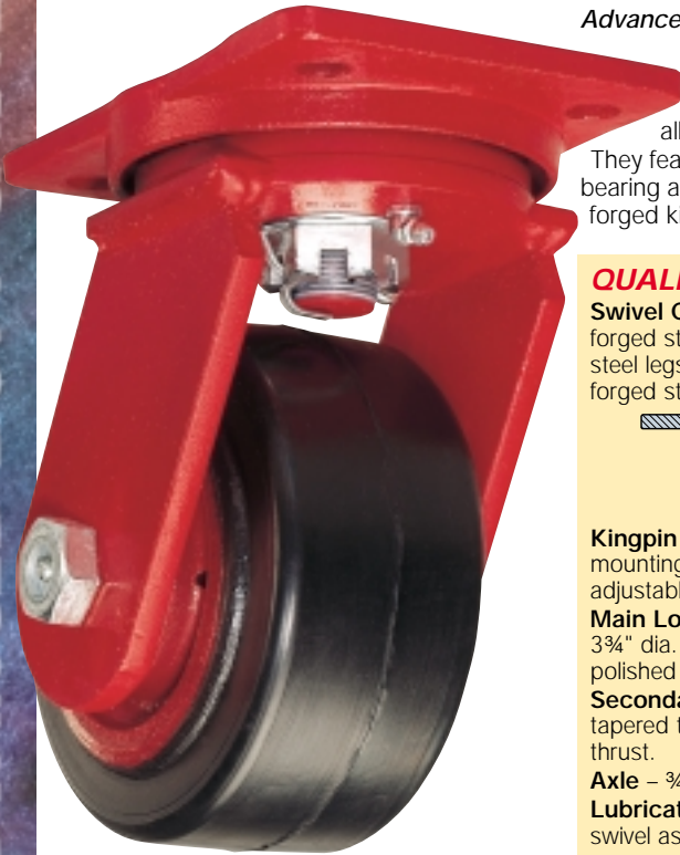
#S-A-63RH Swivel showing Moldon Rubber wheel

Advanced Duty Casters are distinguished by the "ears" of the horn base that provide a generous welding area for the husky legs and allow for lower overall heights. They feature a precision tapered thrust bearing and guaranteed-for-life integrally forged kingpin.