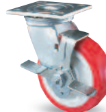
Tread Contact Brake [8" models only]