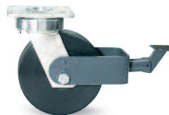
Heavy Duty Contact Brake [8" models only]