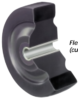
Flexonite wheel (cutaway)

To order, add bearing size to catalog number. Example: W-415-EO-7/16.