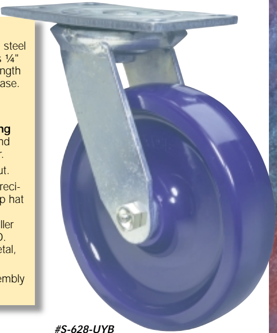
#S-628-UYB Swivel showing Unilast® Solid Elastomer wheel

★ = available for 1-2 day PRONTO® shipment. Dimensions in Inches