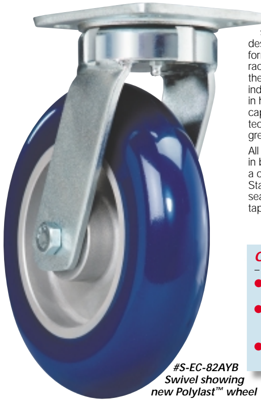
#S-EC-82AYB Swivel showing new Polylast™ wheel

Hamilton announces the new Endurance™ Series casters that represent the "best of breed" in kingpinless-style design. The top plate and inner raceway are formed from one piece, providing a superior raceway for shock conditions. Once formed, the raceways are CNC-machined and then induction hardened to ensure a uniform depth in hardness of the swivel raceway. A sealing cap is welded to the outer race to assure protection from foreign material and to keep grease in the raceway.