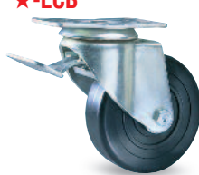
Combination Brake, locks both swivel mechanism and wheel. Available on plate-type swivel models except 3"