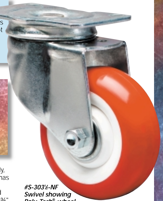
#S-303 1/2-NF Swivel showing Poly-Tech ® wheel

Stem models are offered in two sizes only, as shown in chart. A 4" swivel (#S-342) has a round threaded stem 1/2"-13 x 2" long. The 5" size is available in swivel and rigid models (#S/R-352) with octagonal stem 3/4" x 2 1/16" long with holes for 1/4" bolts."