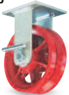
Thumbscrew Brake [rigids only]