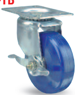
Toe Brake [plate-type swivels only]