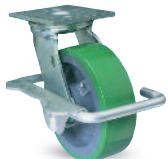
Rap-A-Round Foot Brake