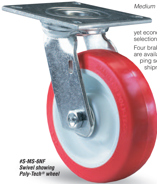
#S-MS-6NF Swivel showing Poly-Tech® wheel

Medium Service Series Casters, differentiated by the 5" x 5½" top plate, are proven performers in Hamilton's 900 lbs. class offering. These rugged, yet economical casters accommodate a wide selection of 2" face wheels.