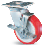
Tread Contact Brake