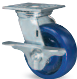
Side Foot Brake