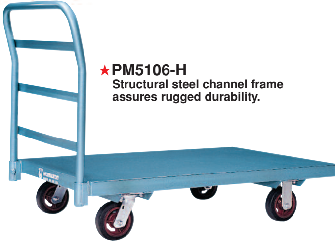
★ PM5106-H Structural steel channel frame assures rugged durability.