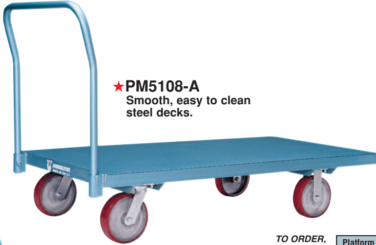
★ PM5108-A Smooth, easy to clean steel decks.