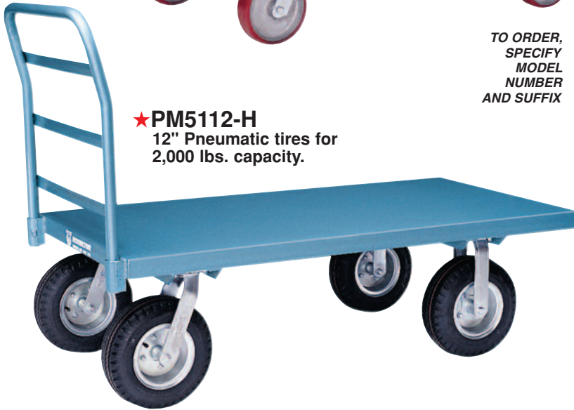
★ PM5112-H 12" Pneumatic tires for 2,000 lbs. capacity.

TO ORDER, SPECIFY MODEL NUMBER AND SUFFIX