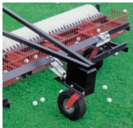
Golf ball collector rolls on pneumatic swivel casters.

Swivel casters on this page feature Forged Steel Integral Kingpins guaranteed for life.