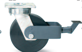
Heavy Duty Contact Brake [8" & 10" models]