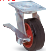
Side Foot Brake [8" to 12" models]