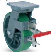
Foot Contact Brake [8" to 18" models]