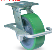
Rap-A-Round Foot Brake [8" to 12" models]