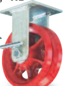
Thumbscrew Brake [8" to 12" models, -HB on 16" & 18"]