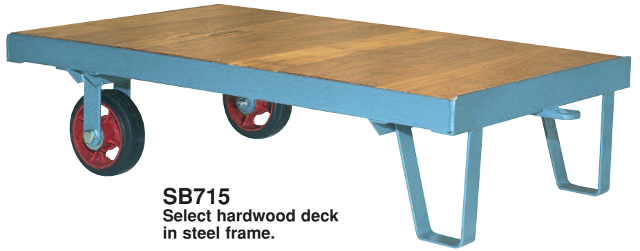
SB715 Select hardwood deck in steel frame.