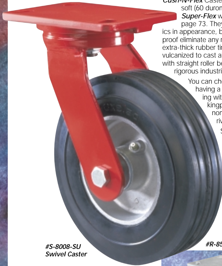
#S-8008-SU Swivel Caster

Cush-N-Flex Casters feature the extra soft (60 durometer), solid rubber Super-Flex wheels described on page 73. They resemble pneumatics in appearance, but being puncture proof eliminate any risk of "flats." The extra-thick rubber tires are permanently vulcanized to cast aluminum hubs fitted with straight roller bearings to withstand rigorous industrial service.