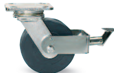
Stainless Steel Heavy Duty Contact Brake