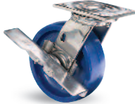
Stainless Steel Side Foot Brake