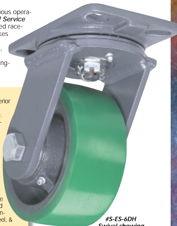
#S-ES-6DH Swivel showing Duralast® wheel