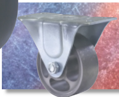
#R-223-M Rigid showing sintered iron wheel