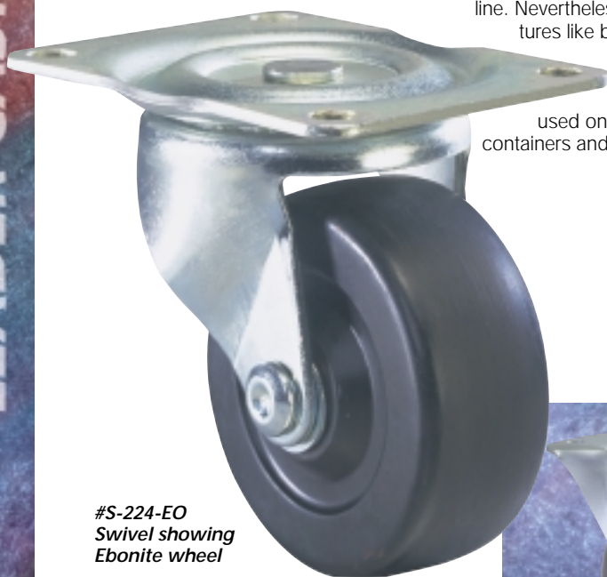
#S-224-EO Swivel showing Ebonite wheel

These are the price leaders of the Hamilton line. Nevertheless, you will find quality features like bright zinc plated finish and hardware, with bolt and nut (not rivet) axles used exclusively. They are popularly used on dollies, laundry trucks, food containers and other light duty equipment.