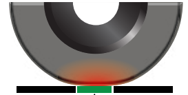
UltraGlide™ & DuraGlide® poly compound