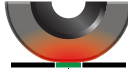
Common heavy load compound