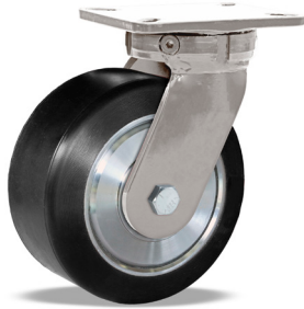
Spinfinity® ZFSEC w/TerraTech®