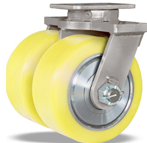
Spinfinity® Dual ZFSEC2 w/TerraTech®