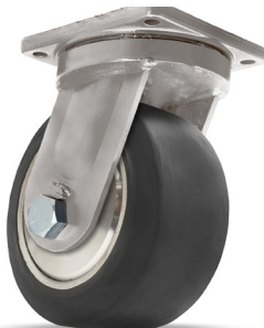
Spinfinity® ZFMD w/TerraTech®